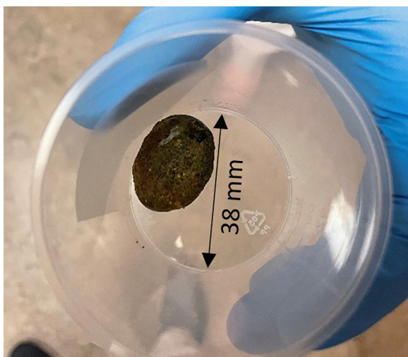
Fig. 2 – Evacuated gallstone.

cholangiopancreatography. The cholecystoenteric fistula was still visible on the second MRI follow-up, 8 months after discharge, but there was no recurrence of gallstones. In view of