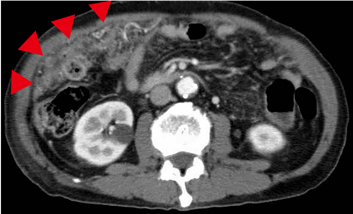
Fig. 1 – Thoracoabdominal computed tomography scan showing mesenteric panniculitis