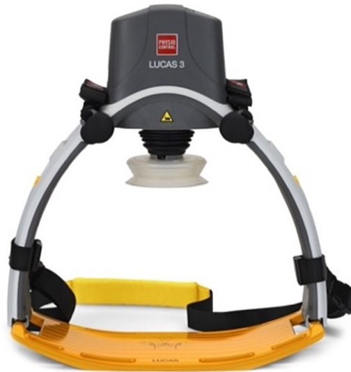
FIGURE 2: Lund University Cardiac Arrest System (LUCAS)

Standard LUCAS 3 chest compression system produced by Stryker (Kalamazoo, Michigan, USA) used in the event of cardiac arrest.