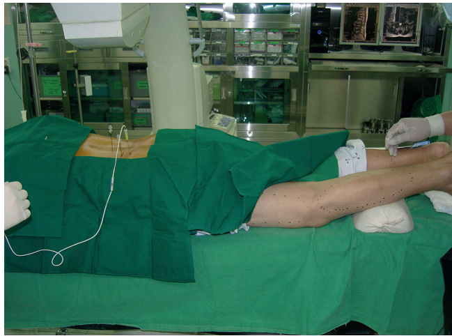
FIGURE 2. Photograph during RF sensory stimulation (case #4). SMK needles are inserted, and RF probe is inserted at S1 level. Skin marking indicates the original pain area at left leg. RF needles are inserted near left L4, L5, and S1 roots. RF: radiofrequency.