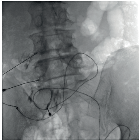
FIGURE 3. C arm view during RF sensory stimulation to search for symptomatic root of left leg pain. RF probe was inserted at left L4 RF needle to make sensory stimulate. RF: radiofrequency.