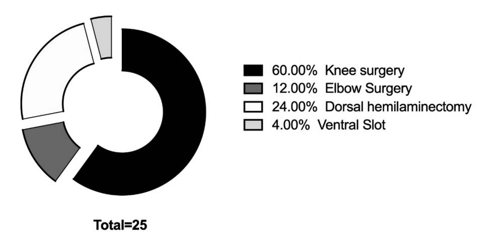
Figure 2. Distribution of surgical procedures included in the study.

Twenty-five dogs (fifty eyes) were included in the study. The average age was (Mean \pm SD) 59.16 \pm 28.09 months; the median weight was 10.55 kg (4–45 kg). There were 16 males and nine females. Median anesthesia time was 137 min (range 75–242 min). Distribution of surgical procedures was reported in Figure 2. No statistically significant differences were found among groups. for the duration of anesthesia (p = 0.134).