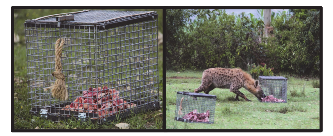
Figure 2. Newly baited puzzle box with door, showing the twisted knot handle that opens the door when pulled. Spotted hyena obtaining raw meat bait from puzzle box without door, with closed puzzle box in the foreground.

In Mekelle, puzzle boxes were placed at two sites, one sight per night to obtain data from at least two discrete clans (Figure 2). Three individuals or groups of hyenas approached on the first night and two on the second night. The average latency to approach was 1156.4 \pm 452.8 s (n = 5). In only one instance did hyenas, in a group of three, consume food from the open puzzle box; this was 3133 s after they approached. No hyenas opened the closed puzzle box.