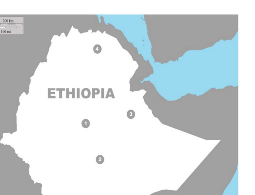
Figure 1. Location of four cities (1: Addis Ababa; 2: Arba Minch; 3: Harar; and 4: Mekelle) in Ethiopia where data were collected on spotted hyenas (1, 3, 4) and human perceptions and beliefs related to humans (2, 3, 4).