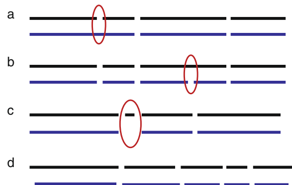
Figure 2 Optical mapping experimental errors. Experimental errors in the optical mapping of individual molecules include (a) missing enzyme cut sites due to incomplete digestion, (b) extra enzyme cut sites due to random breakage of the DNA molecule, (c) missing small fragments due to desorption, and (d) sizing error due to noise in measurements of fluorescence intensity. The ideal, error-free map is shown in black, and the experimentally observed map is shown in blue.

Valouev et al. [7] have developed an alignment algorithm for both finding overlaps between two optical maps and aligning an optical map to a reference map. The scoring function is defined as a log likelihood ratio test for a model that makes the following assumptions: the size of genomic restriction fragments are distributed exponentially; the observations of each restriction site in an optical