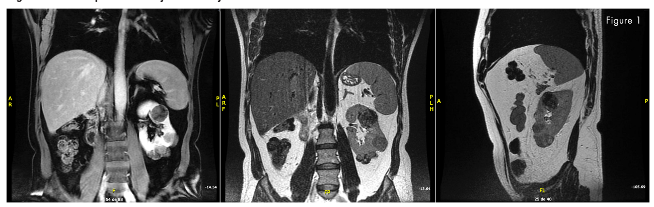
Figure 1 - MRI report - solitary left kidney - at least eleven renal tumors.

ice slush and perfused with a continuous cold storage transplant solution. With ultrasonography aid, a bench nephron-sparing surgery was performed and all tumors resected or enucleated to maximally preserve the normal parenchyma. The incised calyxes were repaired and a meticulous reconstruction of the kidney with absorbable sutures and hemostatic booster interposition made. It was spent 105 minutes to resect and to reconstruct (Figure-2). During the bench surgery the patient was repositioned in the dorsal decubitus and a hemodialysis catheter was inserted in the subclavian right vein. With a Gibson right incision an autotransplantation was performed. Reconstructed kidney was autotransplanted in the retroperitoneum and the vascular axis was anastomosed in the external iliac vein and artery. The ureter was implanted in the bladder by an extravesical Lich--Gregoir antireflux procedure with a double J stent. A Penrose drain was left in place.