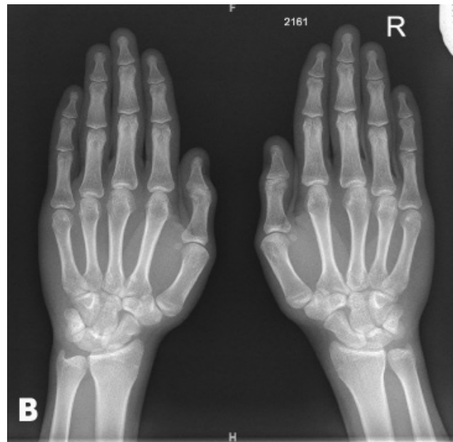
Figure 2 - A) Total anonychia of all nails of fingers and toes of patient one. B) Normal bone appearance of both hands as seen in the x-ray report.