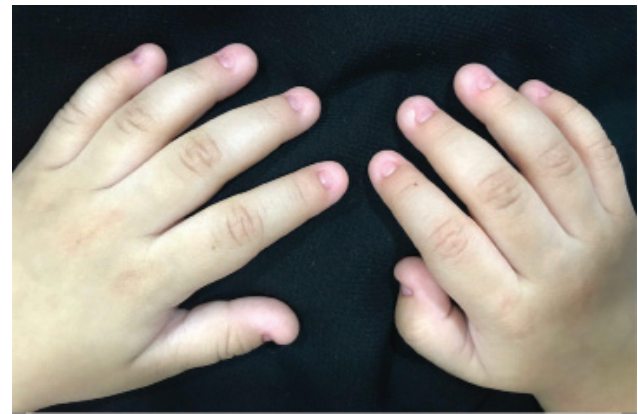
Figure 4 - Total anonychia of all fingernails of patient 3.

It is of an autosomal recessive mode of inheritance with RSPO4 gene mutation mapped to chromosome 20p13 with frameshift splice site and missense mutations in exon 2. 3,5,6 Congenital anonychia may be associated with hypoplastic or missing underlying phalanges and patella, teeth abnormalities, microcephaly, curved digits, single transverse palmar crease, bizarre