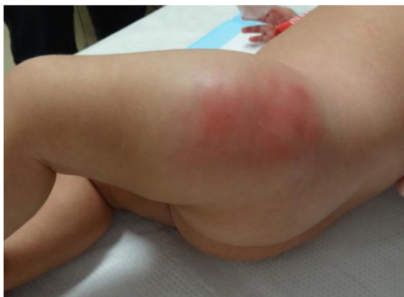
Fig. 1 Erythematous skin lesion at hospitalization