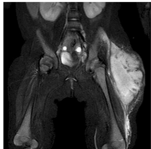
Fig. 3 Magnetic resonance imaging: Fat-suppressed T2-weighted image shows a large subcutaneous fluid collection in the left thigh

Based on her clinical symptoms and the imaging findings, the patient was diagnosed with a subcutaneous abscess. Incision of the subcutaneous abscess resulted in the drainage of a large volume of purulent material. Gram staining of the pus showed encapsulated gram-positive diplococci. The patient was treated with intravenous panipenem/betamipron (PAPM/BP). S. pneumoniae was isolated from the pus, while cultures from blood, skin, and nasopharyngeal samples were all negative. Because the pneumococcal isolate was susceptible to penicillin, PAPM/BP was replaced by intravenous ampicillin on Day 4 of hospitalization. The patient