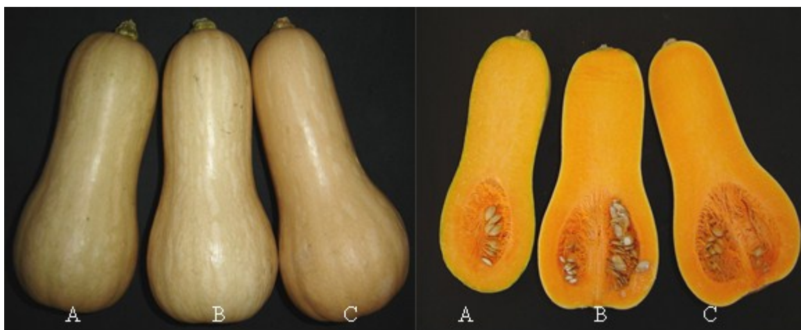
Figure 1. Stages of commercial maturity of the fruits. (A): immature; (B): mature; (C): very mature.

At the end point of cooking, temperature of the pulp was 52 to 56 °C as determined with a temperature probe (Digi-Sense, Vernon Hills, IL USA), and the cubes had a firm texture. The samples were kept in freezer (−20 °C) to perform the analysis.