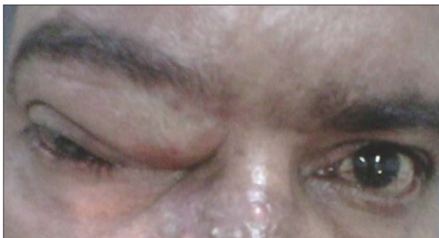
Figure 1: Patient presenting with right supraorbital swelling with right eye vision normal. Patient also has got psoriasis and hence multiple maculopapular lesions are seen on the face

A 53-year-old male patient presented to ENT OPD of our tertiary care institute with chief complaints of right periorbital swelling and pain for last 2 months [Figure 1]. It was associated with complete closure of right eyelid. There was no complaint in left eye. There was no history of nasal obstruction, sneezing, nasal discharge, fever or decreased vision. Patient was a known case of DM and HTN and was on medication for that. Patient was also a case of psoriasis for which he was taking treatment from a dermatologist. There was no history of trauma. There was two times previous history of incision and drainage done outside for right eye swelling about 1 and 2 months back, respectively, but swelling recurred. On clinical examination, ENT examination was normal. Right periorbital swelling was present with reduced palpebral fissure and overlying skin was tense and erythematous. Vision was normal in both eyes. Bilateral pupils were normal and reacting to light. On palpation, right medial