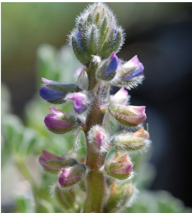
FIGURE 1 Flower peduncle of Lupinus nipomensis Eastw. (Nipomo mesa lupine).

The reintroduction of Nipomo Mesa lupine, and other rare plants with a limited initial population size, requires specific abiotic conditions to maximize reproductive output from reintroduction efforts.