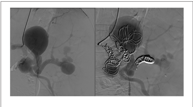
FIGURE 2 | Selective angiography showed that the blood flow to the spleen was significantly reduced.