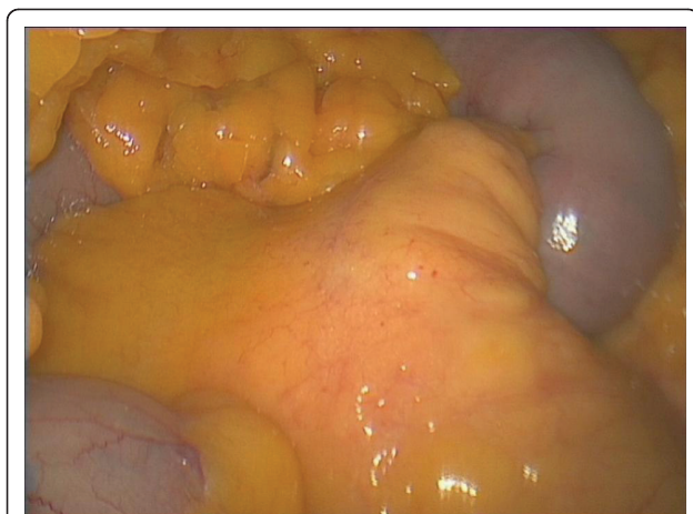
Figure 3 Amorphous thickening of the mesenteric fat, which did not invade into the adjacent organs, visualized during laparoscopic biopsy.

An exophytic renal mass of the left kidney of 15 \times 17 \times 18 mm size had already been noted in the first CT