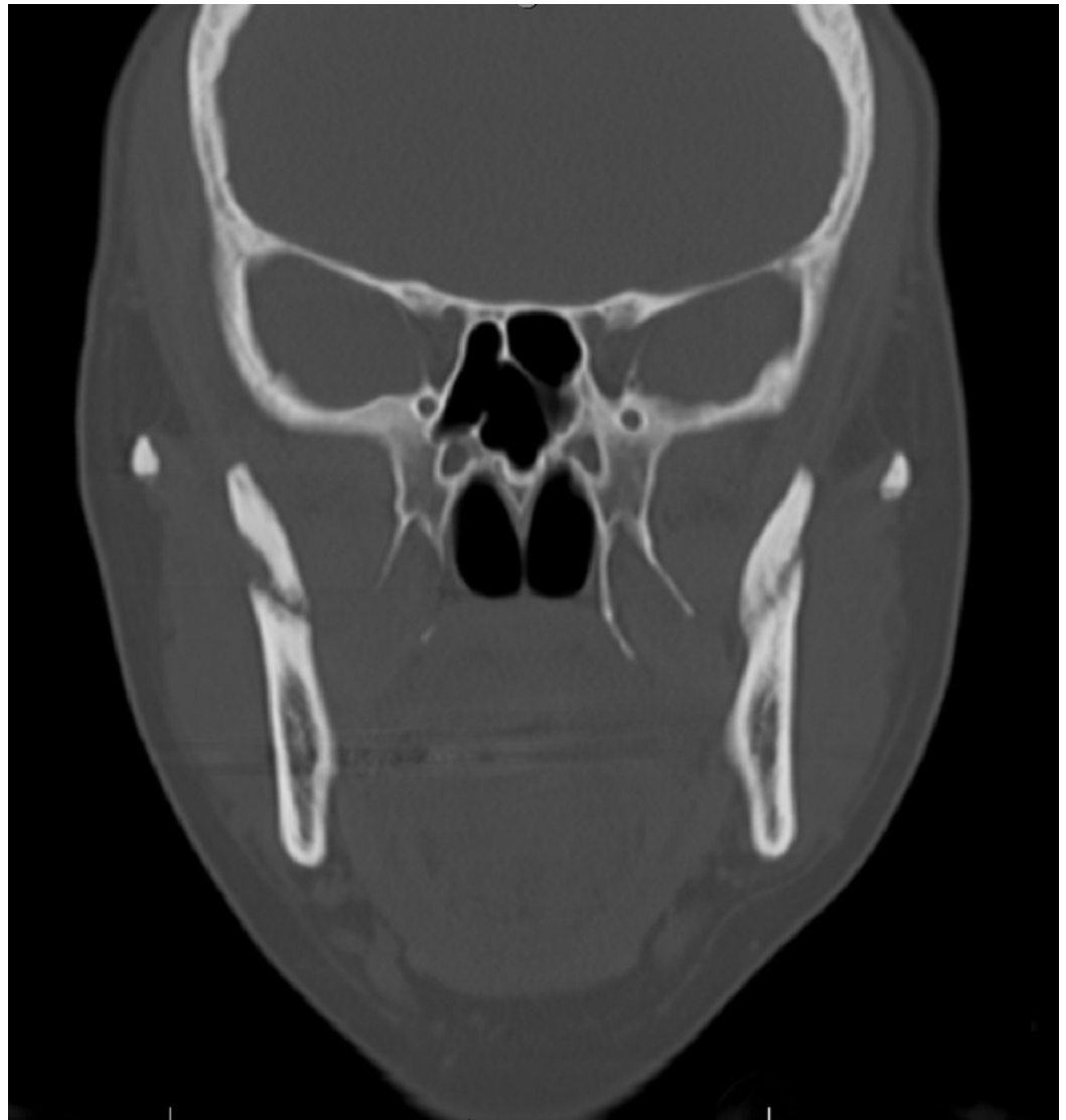
FIGURE 1: Coronal CT shows isolated bilateral coronoid process fracture