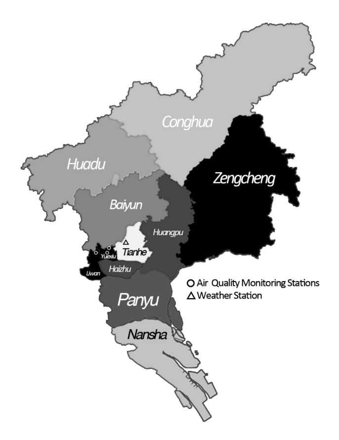
Figure 1. Administrative division of Guangzhou City and the locations of the monitoring stations. This figure illustrates the locations of the study area (Yuexiu District and Liwan District) and the monitoring stations which measured the data of air pollutants and meteorological factors used in the present study.