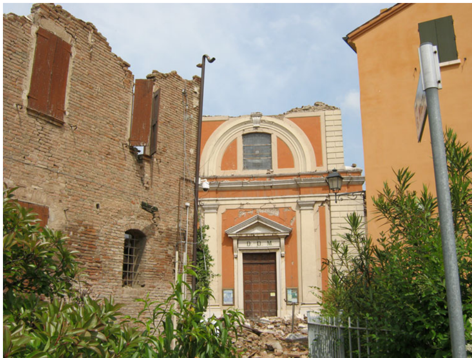
FIG. 1. Parish Church of XVII century destroyed by the earthquake. City of San Felice (Modena).

In all these municipalities, destruction of city centers with different levels of severity occurred. In the province of Modena and Reggio Emilia, according to a classification made by the civil defense, the different cities and villages reported a grade of gravity from 9 to 6. These events caused heavy damage to rural and industrial buildings, to channeling of water, as well as to buildings and historical monuments of artistic interest (Fig. 1) and to the civil old buildings in stone or pebbles. Around 270 schools were totally or partially unusable; there were damages to residential use of new buildings, often attributable to widespread incidents of soil liquefaction. According to an account of the Civil Protection who checked 35,000 structures in Emilia, 22.5% of the buildings were found temporarily or partially unusable, 35.7% and 5.7% unusable for external risk due to elements unsafe whose collapse could affect the building. More than 28 reception areas that received about 5800 people were activated. The total number of people housed was found to be 8200. Unexpected events and conditions just described have created stress, loss, and fear in affected populations, with important impacts on the state of physical and mental health.