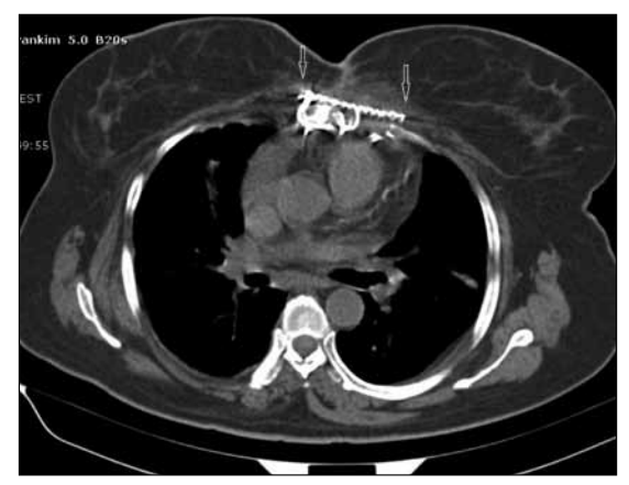
Figure 2 - Control computerized tomography shows successful stabilization of the sternum.