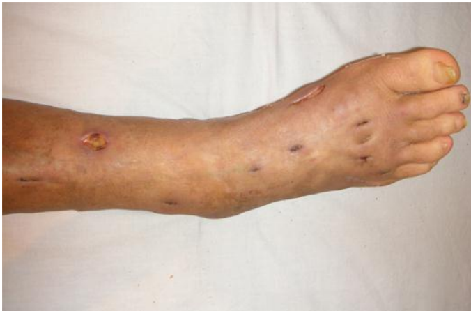
Fig. 1. Multiple subcutaneous abscesses, 10 to 30 mm in size, on the right leg.