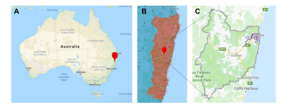
Figure 1. The Clarence Valley in the context of Australia ( A , red marker); the North Coast Primary Health Network ( B , red marker compared to the dark red shaded area) and the Clarence Valley Local Government Area alone ( C , grey outlined area).

The Clarence Valley Local Government Area (LGA) has 51,570 residents and covers 10,441 km<sup>2</sup> on the northern coast of NSW in Australia (see Figure 1). The LGA is served by the Northern NSW Local Health District (LHD) who deliver secondary and tertiary care, with approximately 300,000 residents across 20,732 km<sup>2</sup> and the North Coast Primary Health Network (PHN), who support primary care, with approximately 520,000 residents across 32,047 km<sup>2</sup> [33,34].