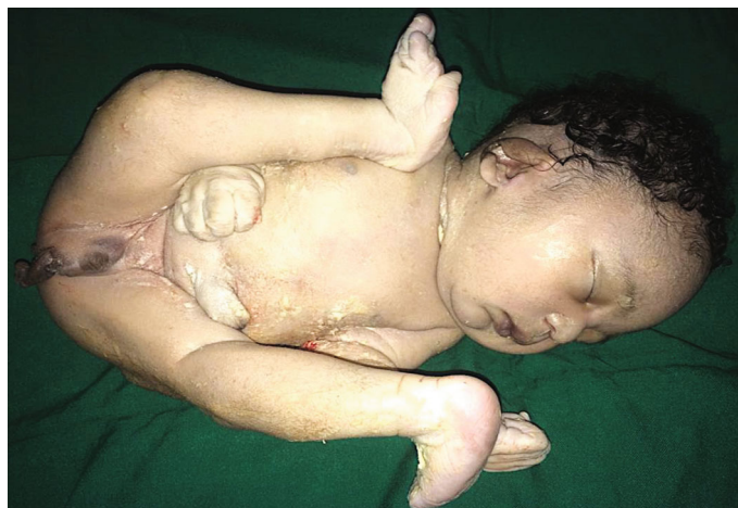
FIGURE 2: Lateral rotation of the left leg and 4 digits on the right foot.