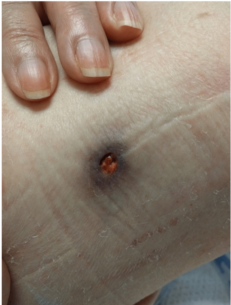
FIGURE 2: Lateral right thigh (0.5x0.5 cm).

An X-ray of the largest ulcer on her right calf showed no extension to the bone. A deep wound punch biopsy was performed where the pathology had shown microabscesses and focally diffuse neutrophilic infiltrates, histiocytic inflammatory response, as well as scattered multi-nucleated giant cells with granulomatous formation (Figure 3). With concern for osteomyelitis or bacterial seeding, a CT-guided core biopsy was performed on the spinal collection and pathology revealed chronic inflammation, including aggregates of small lymphocytes, plasma cells, and foamy histiocytes, associated with fat necrosis without notes of granulomas. An infectious disease workup of both areas, including mycobacterium, fungal organisms, and bacterial and viral organisms, was negative.