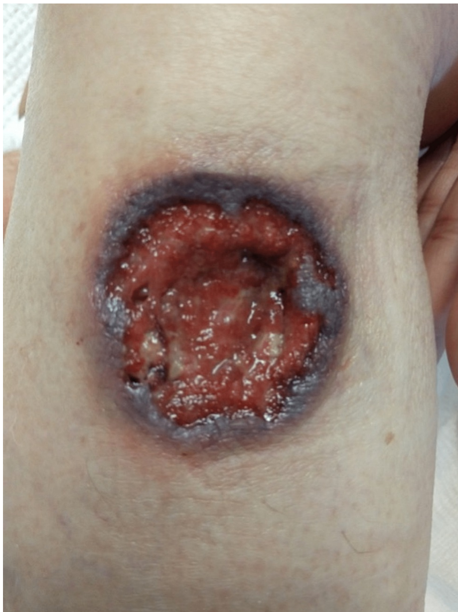
FIGURE 1: Medial right shin (4x4 cm).