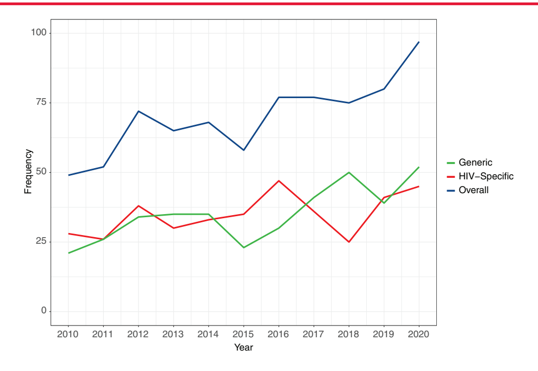
Figure 2. The number of HRQoL instruments used over time.