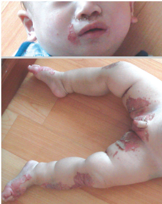
Fig. 1. An 8-month-old boy with erythematous and desquamated skin lesions around knees, feet, and perioral and inguinal areas.

We found that the patient was compound heterozygous for 2