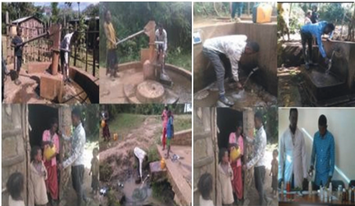
FIGURE 2: Water sampling and quality testing at a water quality laboratory.

willingness and the participants had the full right not to participate.