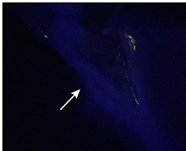
Fig. 3 Visualisation of the cystic duct (pointed by arrow) and common bile duct, 45 min (time point of maximal signal) after injecting 6 mg of IRDye® 800CW (1 mg/mL). Note the white spots are caused by scattering, and do not represent the fluorescent signal

properties of the new dyes and compare these to the performance of IRDye® 800CW. Eventually, these dyes could be an alternative to ICG, the only dye presently available for human use in NIRF imaging of the biliary system. This would be desirable, as with ICG, although NIRF visualisation of the bile ducts can be achieved, the observed contrast of target-to-background leaves room for improvement. Other advantages are a shorter period between injection of the dye and visualisation of the target structures and the fact that these new dyes contain no iodine, whereas some