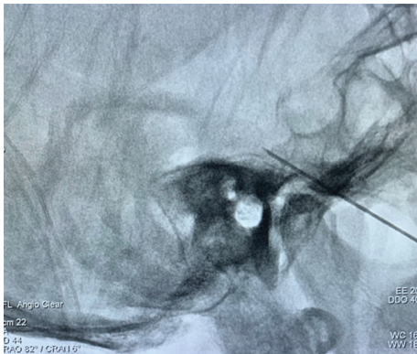
FIGURE 2: The position of the ophthalmic branch of the trigeminal ganglion is located over the slope line 3 mm and the trocar tip was shown in the right position.

structure; an analysis of the primary and secondary end-points of the full analysis set, which contained unbalanced data, was conducted. A p value < 0.05 was deemed statistically significant and p value < 0.001 was deemed statistically very significant.