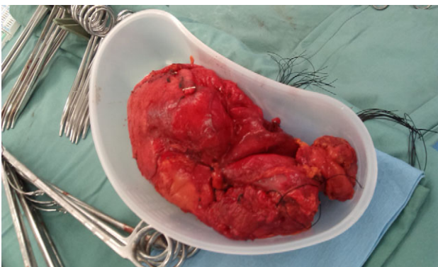
Figure 3: The pelvic cyst once removed minus hydatid fluid and daughter cysts.

Histology showed hydatid cysts and a diagnosis of EG was postulated. He completed a 7-day post-operative course of Praziquantel and 6 months of Albendazole. One year post-surgery repeat CT and MRI abdomen and pelvis show no recurrence.