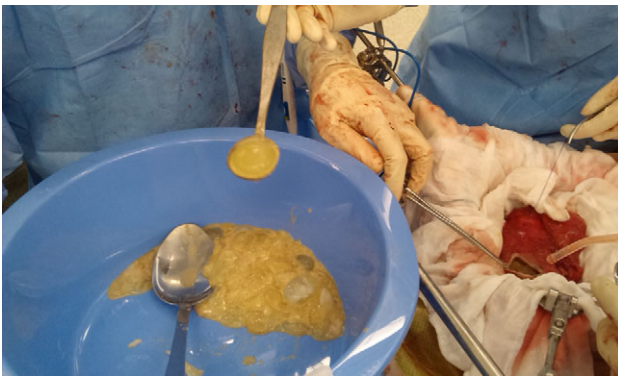
Figure 2: Intraoperative photograph showing the cystotomy and contents being removed. Daughter cysts are shown in the bowl (clear, jelly like structures).