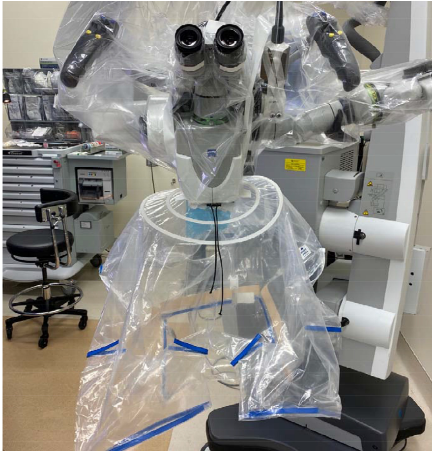
Figure 2 Custom designed microscope drape (Grace Medical) featuring structure, operator arm ports, suction port, attachment device to the microscope lens, and adhesive to the patient side).

useful considerations to support the decision making of practicing otolaryngologists.