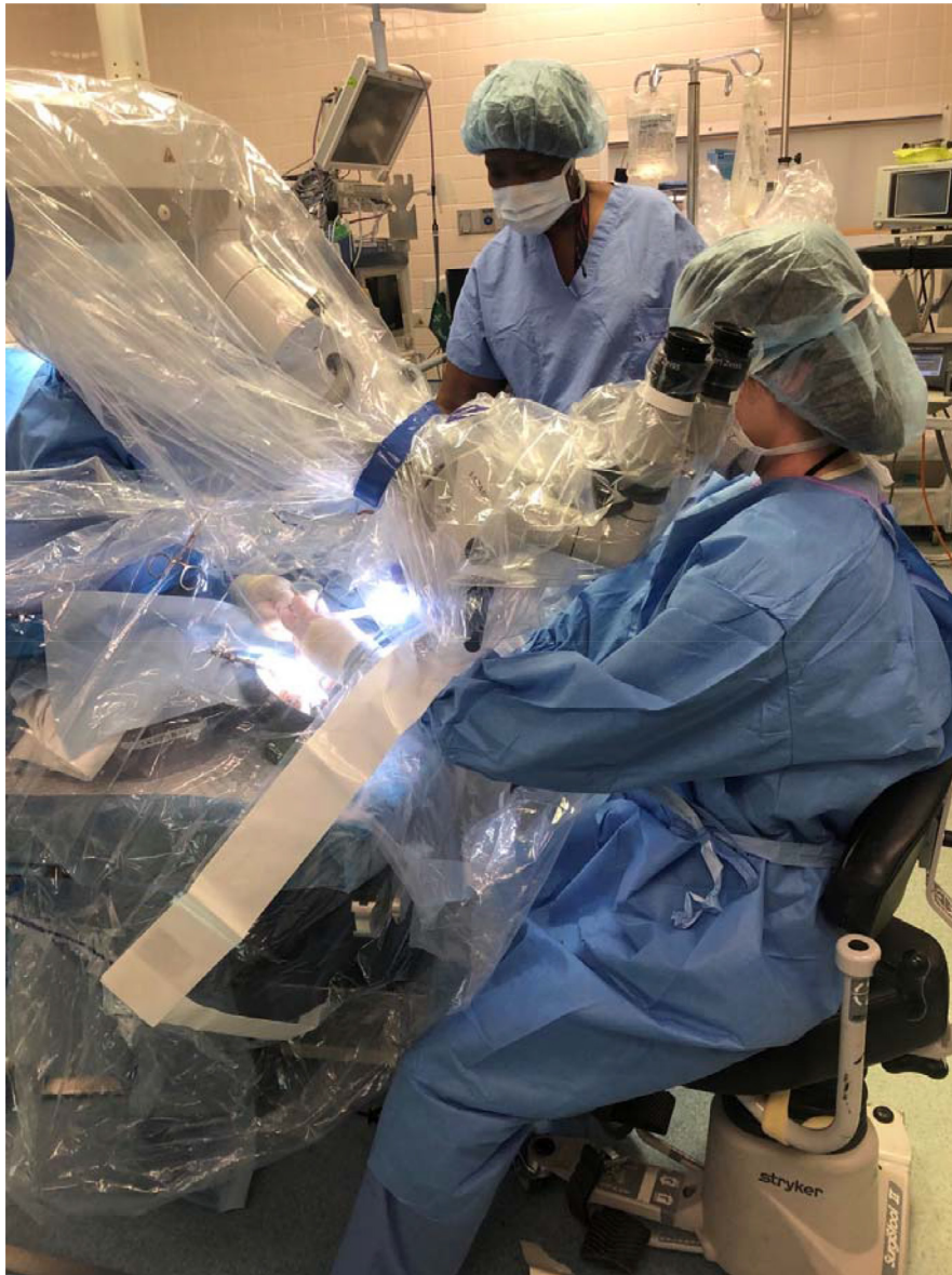
Figure 4 Surgical technician passing instrument to surgeon through a transparent OtoTent fashioned from C-Armor drape (Tidi).

most providers the best drape material is probably the 1 that is readily available. Transparent drapes are advantageous over opaque drapes as they allow the surgeon and surgical technician better visualization of the field. Incorporating a Mayo stand within the drape with commonly used instruments limits manipulation of the drape. A second scavenger suction positioned near the operative site can mitigate particle dispersion. Adding povidone iodine to the irrigation solution is simple, inexpensive, theoretically virucidal, produces minimal discoloration, and has not been shown to be ototoxic. 19 Placing the surgeon's arms through the drapes rather than under the drapes may limit escape of aerosols. Delaying removal of the drape after completion of drilling minimizes release of airborne particles. Although the risk of viral transmission during mastoidectomy remains unknown, these measures remain options for consideration when an abundance of caution is indicated.