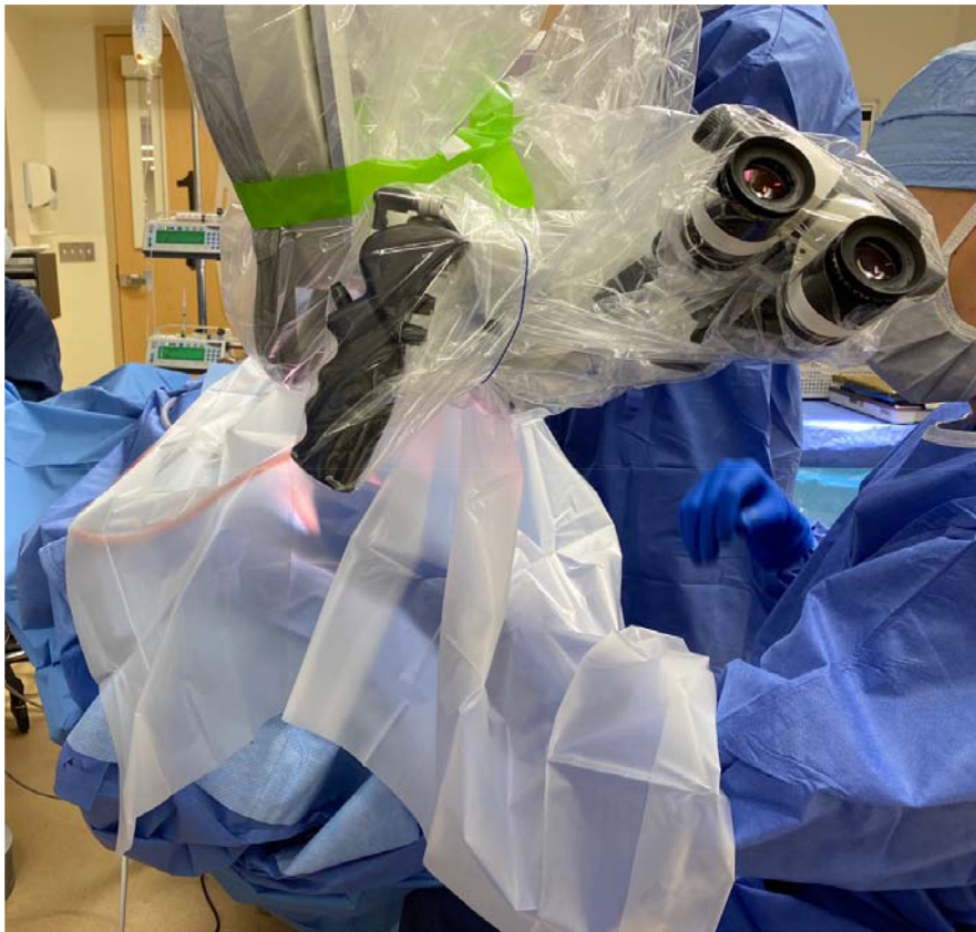
Figure 1 Demonstration of in-vivo utilization of the 'Ototent' fashioned from a 1060 Steri-Drape (3M).

the absence of definitive answers, the safety of surgically instrumenting the middle ear was called into question. Perhaps most importantly, it remains unclear what precautions should be taken.