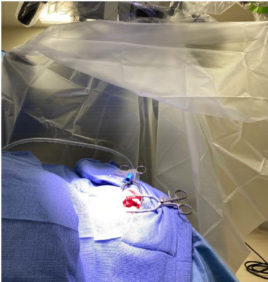
Figure 3 A view from underneath the 'OtoTent' demonstrates a second 'scavenger' suction positioned near the operative site to reduce particle dispersion during drilling.

aerosolization of viral particles with powered instruments combined with the limited ability of the surgeon to wear adequate PPE, investigators began to experiment with methods of particle mitigation during mastoidectomy.