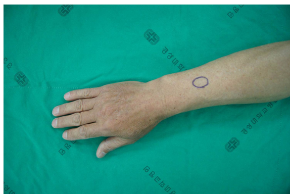
Fig. 1 Pre-operative clinical photograph shows a vague, mass-like lesion that had a definite local tender point on the dorsal aspect of the forearm

A 68-year-old Asian man without a particular medical history visited our hospital with a complaint of a mass with focal tenderness that had developed 8 years earlier in his left distal forearm. He did not complain of cold hypersensitivity (worsening of pain when exposed to coldness), but he had positive findings for Tinel's sign accompanied by serious numbness upon percussion. The mass had a round, soft surface of about 0.8cm in macroscopic appearance, and it was movable within a narrow range (Fig. 1). The patient did not have motor weakness, radiating pain, or a sensory change in the distal mass. He had no particular family medical history, and he had no pain or discomfort unless the tumor was pressed. Hematologic testing and plain radiography performed in the hospital produced no special findings. High-resolution ultrasonography was done to identify the size, accurate location, and patterns of the tumor. Magnetic resonance imaging (MRI) was not performed, owing to financial reasons expressed by the patient. A 0.9cm nodule was observed on an ultrasound. It was located in the subcutaneous fat layer of the forearm. It was a well-defined hypoechoic tumor with slight acoustic enhancement. The blood vessel was observed to be