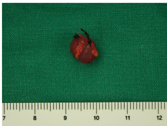
Fig. 3 Intra-operative photograph shows a dark red solid tumor. The tumor is well-defined and sheathed within a fibrous capsule, and it has a feeder vessel (black ties)

which the glomus tumor often affects, but in the forearm. Because the tumor size was very small, and because it presented without skin discoloration, it was difficult to suspect a glomus tumor until the biopsy result was identified. Also, the patient had not visited the hospital when he first noticed his symptoms, because he had no particular pain unless the lesion was pressed, and he had been careful not to press the lesion to prevent pain in his everyday life. He was diagnosed 8 years after the first symptom occurrence.