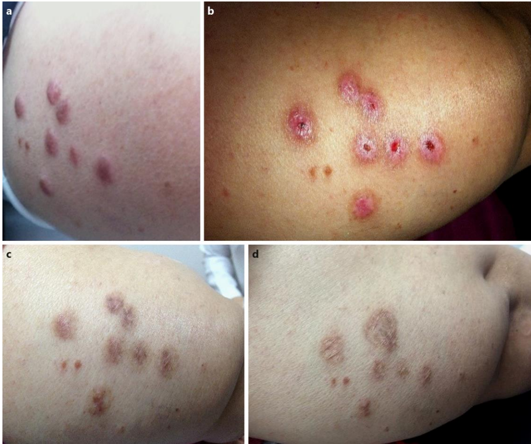
Fig. 1. a Multiple firm, flesh-colored and red-brown papules and nodules in a cluster present on the extensor surface of the patient's right arm. b Lesions after 2 weeks of liquid nitrogen cryotherapy. c Lesions after 4 weeks of liquid nitrogen cryotherapy. d Lesions after 1 year of liquid nitrogen cryotherapy.

Basendwh et al.: Reed's Syndrome: A Case of Multiple Cutaneous Leiomyomas Treated with Liquid Nitrogen Cryotherapy