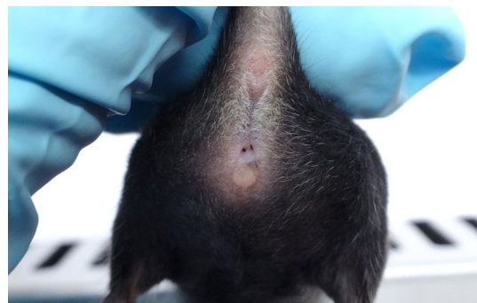
Fig. 1 Vaginal Septum bifurcating the vulva and vagina of a C57BL/6J wild-type mouse