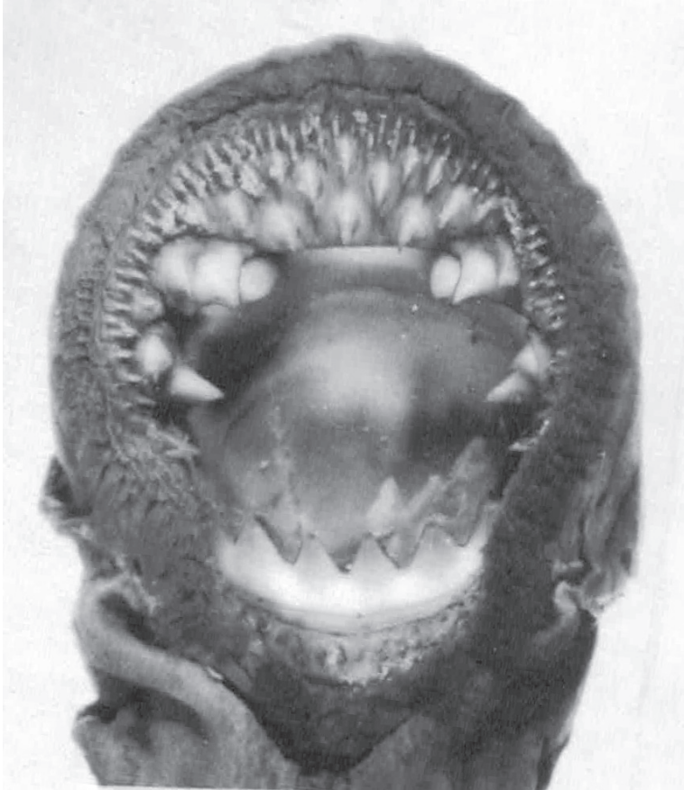
Figure 6. Oral disc of syntype of Lampetra morii , CMNFI 1986–757 (formerly part of ZIN 23145), 171 mm TL.