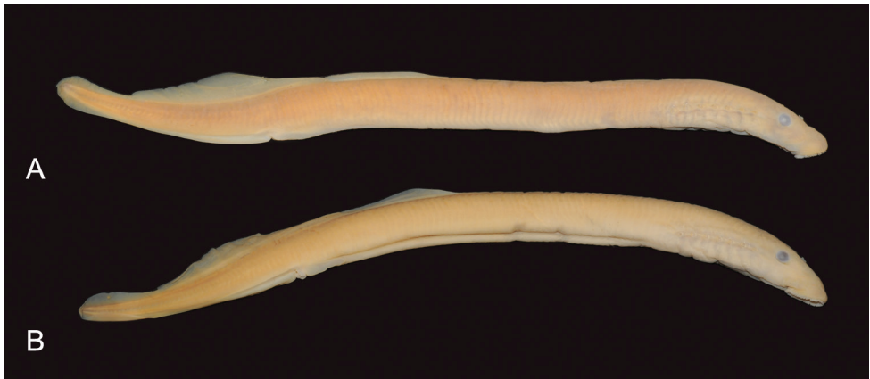
Figure 4. Syntypes of Lampetra mitsukurii , ZMB 20638, 138.3 (a) and 140.1 (b) mm TL.

Gifu (eleven localities on Honshu Island), Matsuyama (Shikoku Island), Kumamoto (Kyushu Island). It is supplemented by drawings of the body of a spawning male and a spawning female from Sapporo in side-view, as well as close-ups of their cloacal regions (Hatta 1911: figs 3, 4 and 7, 8, respectively). The written description of La. m. major is based on an unspecified number of metamorphosed specimens measuring 350–410 mm TL from Sapporo (Hokkaido Island); the maximum TL in the range having been determined from Hatta (1911: fig. 1). It is supplemented by drawings of the body of a spawning male and a spawning female in side-view, as well as close-ups of their cloacal regions (Hatta 1911: figs 1, 2 and 5, 6, respectively). The males of both subspecies possess well-developed urogenital papillae and the females of both subspecies possess well-developed anal fin-like folds. Both subspecies are diagnosable from Japanese La. japonica because the latter is larger (450–507 mm TL), not externally sexually dimorphic, its supraoral and infraoral laminae cusps are sharp instead of blunt and its intestine relatively thick instead of thread-like. Additionally, while La. m. major arrives on its spawning grounds at the end of April, La. japonica arrives on its spawning grounds in late May or early June. La. m. major is sympatric with La. m. minor at Sapporo and is often found attached to the latter, but is allopatric with La. japonica . No type material was studied.