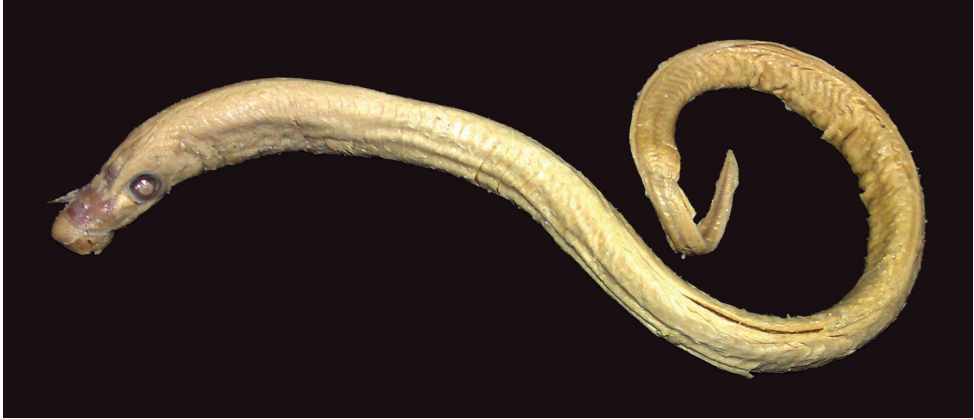
Figure 3. Syntype of Petromyzon kessleri , TGU 3 [no. 3699 in loganzen (1935b: table 3)], 182 mm TL.