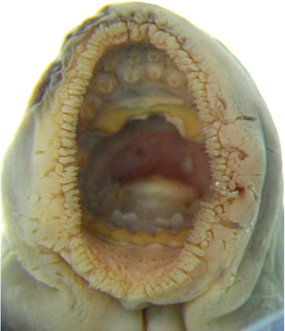
Figure 5. Oral disc of Lethenteron reissneri , ZIN 25204, 146 mm TL with two rows of posteriors from Tym' River, Sakhalin Island, Russia.