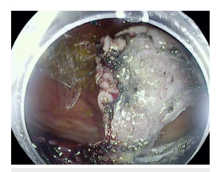
▶ Fig. 4 Dynamic retraction is used for submucosal dissection.

ESD using the device in an animal model for a total of five procedures in two training sessions. Then, we started to perform ESD using DEIP at Baylor College of Medicine. Two DEIP procedures were performed in 2017. In 2018, 17 colonic lesions were removed with a standard colonic ESD approach versus five lesions removed with DEIP. In 2019, 14 colonic lesions were removed with a standard ESD approach and 53 lesions were removed by DEIP. The choice between the approaches was left to the endoscopist's preference based on the availability of the device or endoscopy staff familiar with operating the device at the time of the procedure.