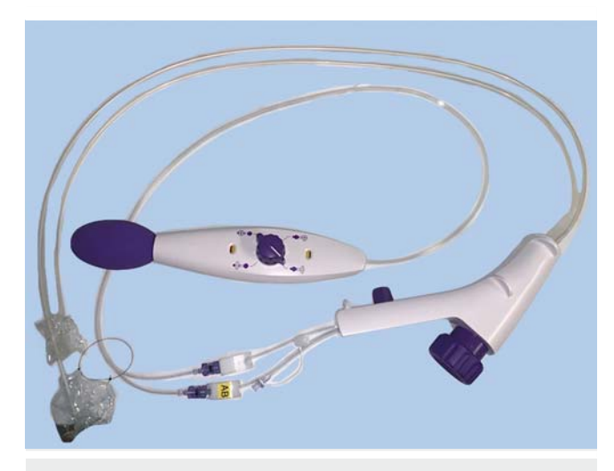
▶ Fig. 1 Double-balloon endoluminal intervention platform (DEIP).

All ESD procedures were carried out by a single experienced endoscopist (M.O.), using a single-channel video endoscope with water jet function Pentax EC38-i10 L (Pentax America, Montvale, New Jersey, United States). M.O. started performing ESD in 2014 and had performed more than 500 ESDs at the time of writing this manuscript. DEIP became available in our center in September 2017, and all colon ESDs done prior to that time were performed using a standard ESD approach (18 lesions). Training using the DEIP was completed by performing