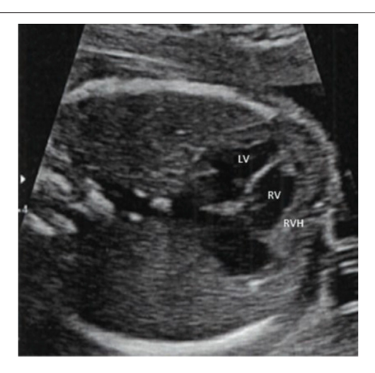
FIGURE 1 | Apical 4 chamber during fetal echocardiography at 32 weeks of gestation. Cardiac ventricular asymmetry and right ventricle cardiac hypertrophy. LV: Left Ventricle; RV: Right Ventricle; RVH: Right Ventricle Hypertrophy.

A CT scan with contrast was performed 5 days after birth, showing an aneurysm of the inter-atrial septum without