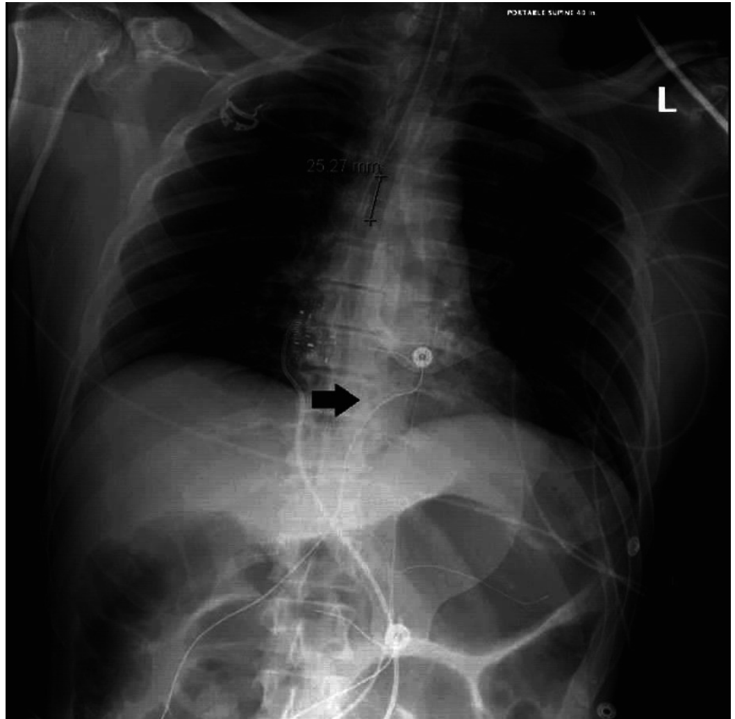
FIGURE 1: Tip of PICC (black arrow) approximately 8 cm distal to cavo-atrial junction as the likely cause of bradycardia in case 1.

PICC placement was completed by the specialized PICC nursing team. After the PICC was placed, the patient developed sinus bradycardia at a rate of 42 beats per minute per telemetry. Before atropine could be delivered, the patient became unresponsive and pulseless and a code team was called for the patient. Advanced cardiac life support (ACLS) protocol for pulseless electrical activity (PEA) was followed with cardiopulmonary resuscitation performed for two minutes and the administration of epinephrine. Resuscitation measures were successful and the return of spontaneous circulation (ROSC) was achieved. The patient was intubated and sedated. When the PICC line was flushed post-ROSC, it was noted on telemetry that the patient went into episodes of sinus tachycardia that lasted between 10-50 seconds as well as periodic wide complex ventricular tachycardia of up to 20 beats. On chest radiograph (CXR), the PICC line was noted as terminating in the right atrium (Figure 1).