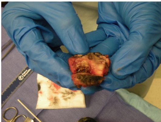
FIGURE 3: Resected left lower pole inked margin demonstrated by intraoperative pathology consult.

and complications (urologic and nonurologic). TNM stage was defined by the American Joint Committee on Cancer 2002 [18]. Renal function was determined by serum creatinine (mg/dL) measurement and calculated estimated glomerular filtration rate (eGFR) using the MDRD formula ( eGFR (in mL per minute per 1.73 \text{ m}^2 ) = 186 \times sCr - 1.154 \times \text{age}^{0.203} \times (0.742 \text{ if female}) \times (1.210 \text{ if black}) ) [19]. Means were compared between the two groups (multiport and