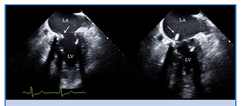
FIGURE 3. Transesophageal images from the 4-chamber view showing an echo-dense mobile linear mass (arrow) attached to a calcified mitral annulus during diastole (left) and systole (right). LA = left atrium; LV = left ventricle.

Cardiac valvular masses and nonbacterial thrombotic endocarditis (also known as Libman-Sacks endocarditis or marantic endocarditis) are rare disorders that appear as echodensities on the affected valves.<sup>11</sup> The diagnosis requires a high index of suspicion because most cases are asymptomatic until thromboembolic complications such as stroke occur.<sup>11</sup> The differential diagnosis for masslike echodensities includes primary cardiac tumors such as