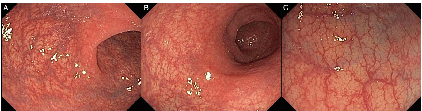
Figure 2. Two-month follow-up flexible sigmoidoscopy of the (A) rectum showing only mild erythema and mild friability up to 25 cm. Otherwise, the (B) sigmoid colon and (C) descending colon were normal to the splenic flexure.

This case suggests that disease activity, even mild to moderate, can reduce the success of IVF, as our patient had 4 unsuccessful IVF trials in the setting of active UC. This case also corroborates expert considerations that conception may be best attempted after 6 months of remission, primarily advised to minimize the risk of active disease during pregnancy. 12,16 Our patient’s unsuccessful fifth cycle of IVF was administered 2 months after starting topical and oral therapy for UC, but the increased bHCG response could be suggestive of an improved response, as increased bHCG levels are