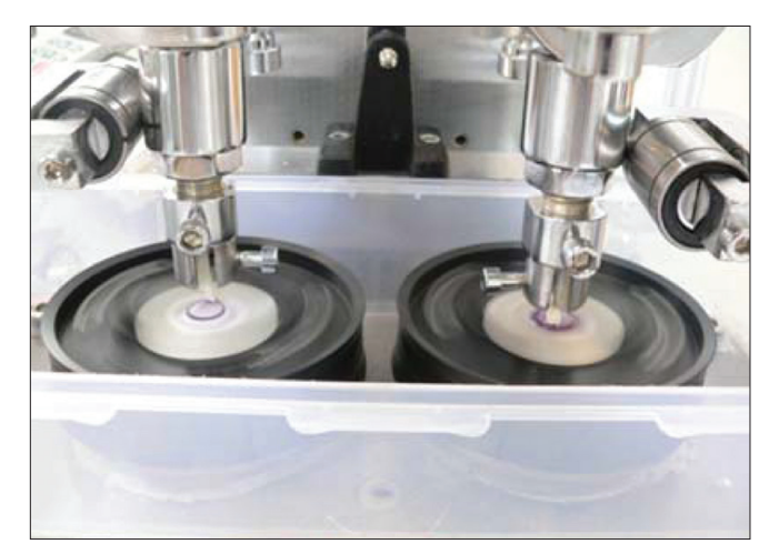
Figure 3: Two specimens were simultaneously