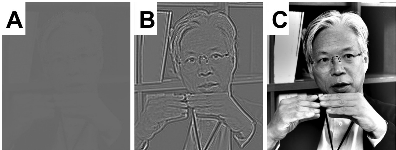
Figure 1. Simulations showing how a quarter-wave phase plate improves the contrast of in-focus images. In these simulations the intensity of the beam (which can be made of light or electrons) remains the same everywhere it passes through the “transparent” object; however, the phase changes significantly where the beam passes through different parts of the object. (A) A perfectly focused, bright-field image has almost no contrast because it can only show variations in the transmitted intensity. (B) A defocused image is able to capture at least a small part of the changes in the phase, so the contrast is better and the object can be seen. (C) Zernike realized that changing the phase of the unscattered portion of the transmitted wave (that is, the part that was not deflected when the wave passed through the object) by 90 degrees greatly improved the quality of the image. The scientist in the photograph is Professor Kuniaki Nagayama, who has played a seminal role in the development of phase plates for use in the transmission electron microscope.

transforming the field of electron cryo-tomography (Danev et al., 2014; Mahamid et al., 2016).