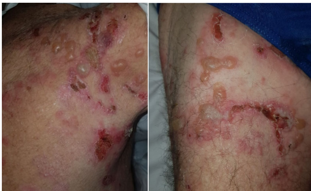
Fig. 1 Pictures 1 and 2: day of admission (2 days before chemotherapy)

Although eligible for first-line immunotherapy, because of the likelihood of autoimmune mechanism and association of bullous pemphigoid, the decision was made to treat with chemotherapy. He was treated with carboplatin and gemcitabine [23], based on a previous case report of BP associated with squamous cell carcinoma treated with cisplatin and gemcitabine. The dose was reduced at 75% of the calculated dose due to his age and high risk of toxicity predicted by Cancer and Aging Research Group (CAGR) chemotherapy toxicity calculator. A significant response was seen within 3 days of chemotherapy as depicted in Figs. 3 and 4 (pictures 3–6). But the subsequent dose of chemotherapy had to be withheld after he developed small bowel obstruction secondary to incarcerated inguinal hernia. Even after stopping chemotherapy, the bullous pemphigoid rashes continued to remain in remission after marked clinical improvement (Fig. 5, pictures 7 and 8). On further follow-up, he wanted to pursue best supportive care under palliative care team, hence further scans were not organized.