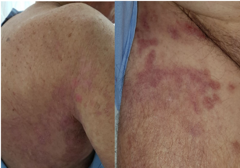
Fig. 5 Pictures 7 and 8: week 5, chemotherapy stopped

Since 1960, there have been case reports of bullous pemphigoid associated with lung carcinoma, although only a few include details of treatment in the metastatic setting. Data regarding the treatment regimen used for lung cancer in elderly patients with bullous pemphigoid