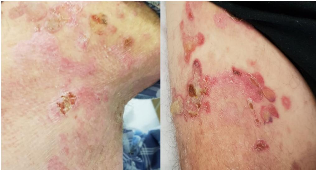
Fig. 3 Pictures 3 and 4: day 3 post-chemotherapy