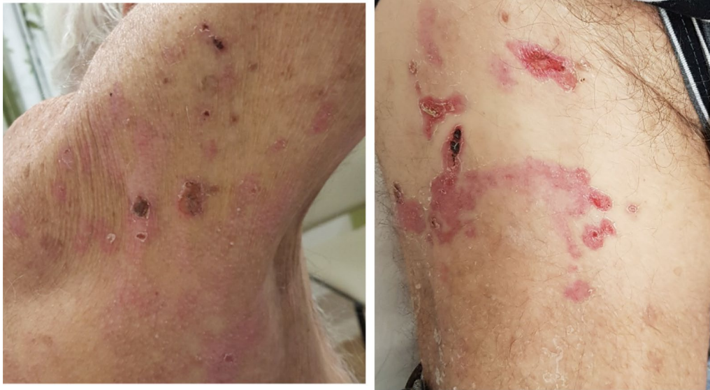
Fig. 4 Pictures 5 and 6: day 14 of chemotherapy