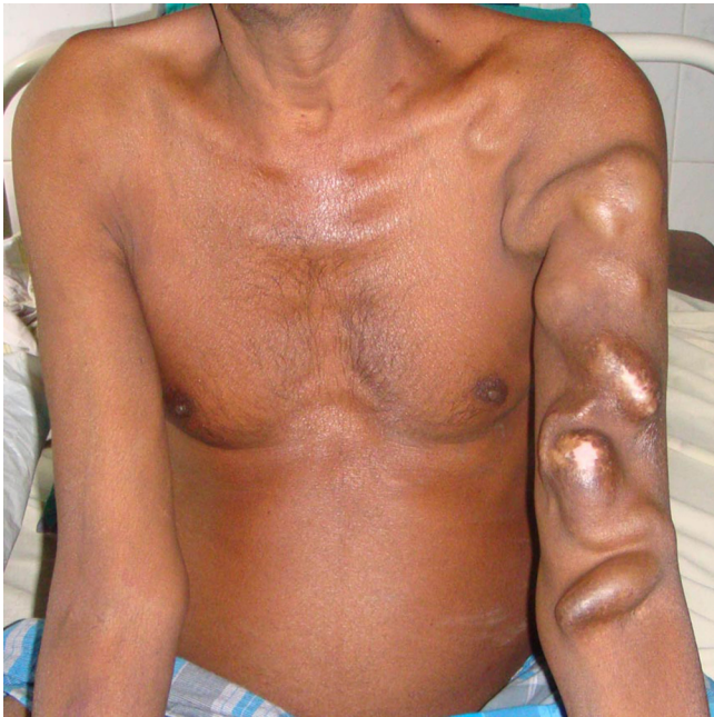
Figure 1 Giant arteriovenous fistula. Photograph of the patient's upper body, with the left arm showing a giant arteriovenous fistula extending from the cubital fossa of the left arm up to the left supraclavicular area.

breathlessness over the past 15 days. There was no history of associated chest pain, palpitations, syncope, cough, expectoration, or orthopnea.