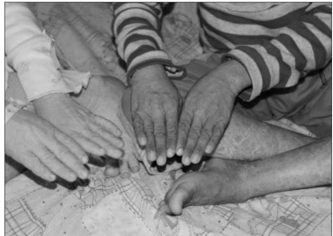
Figure 1: Mild erythema and fine desquamation of the skin especially on the extensor surfaces of the extremities.

The patients were put on a special diet and multivitamin program to treat their malnutrition and other symptoms. This diet