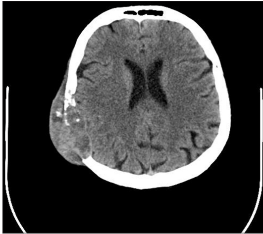
Figure 1: Pre-operative CT scan of the head showing a large osteolytic lesion of the right calvaria