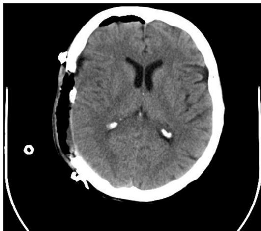
Figure 3: Post-operative CT scan of the head displaying the complete resection of the metastatic lesion replaced by a heterologous cranioplasty

metastasis was 10 months. The most common locations are pelvis, spine, and lower-extremities bones, but other sites have been rarely reported (ribs, facial bones, and skull). Sporadic