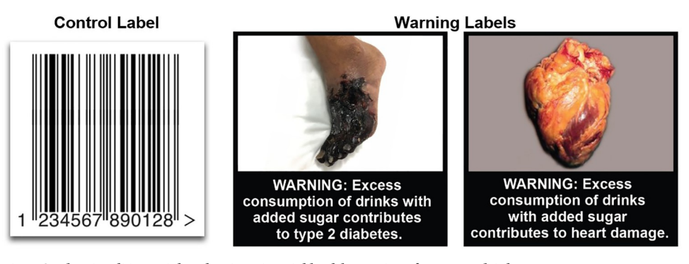
Fig 1. Study stimuli in a trial evaluating pictorial health warnings for sugary drinks.

https://doi.org/10.1371/journal.pmed.1003885.g001