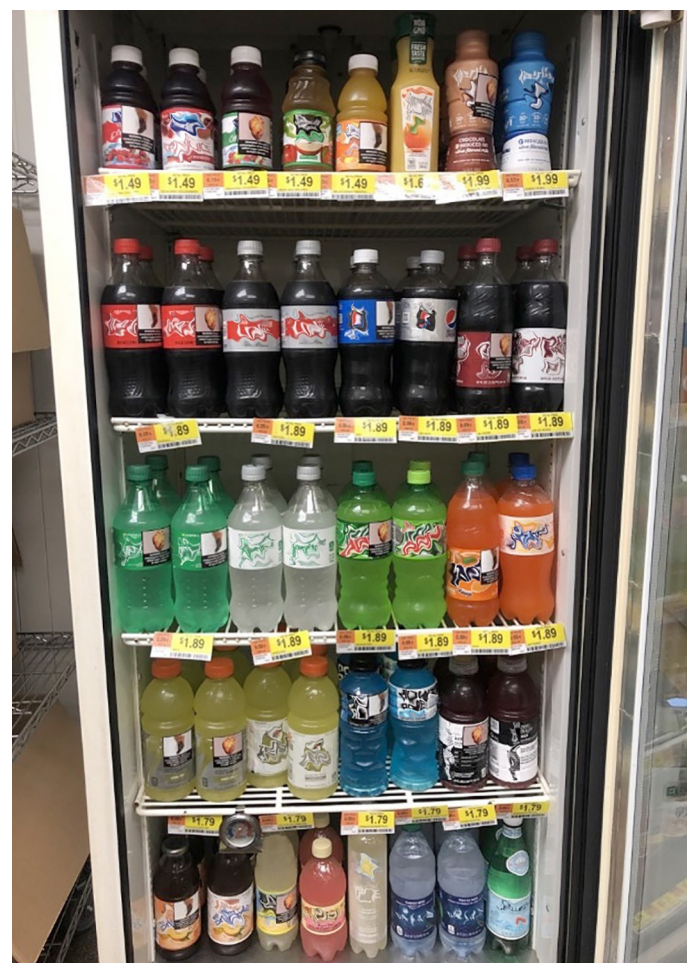
Fig 2. Photographs of UNC Mini Mart during a trial evaluating graphic health warnings for sugary drinks. https://doi.org/10.1371/journal.pmed.1003885.g002

After the shopping task, participants completed a survey programmed in Qualtrics on a computer or tablet in a separate room. Upon completing the survey, the research staff provided the participant with their cash incentive and a 1-page informational handout about sugary drinks. To simplify incentive distribution, research staff rounded down the cost of the beverage to the nearest dollar ($1 or $2, depending on beverage), so all participants left the study with their selected beverage and either $38 or $39.