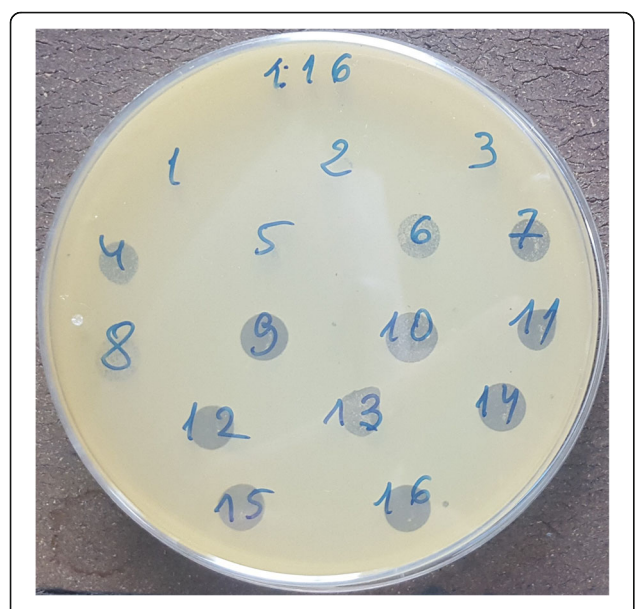
Fig. 2 Bacteriophage sensitivity testing to Escherichia coli : The Escherichia coli culture reacts positively to 12 phages out of 16. Confluent (complete) lysis can be seen for phages #9, 14 and 16, overgrown (partial) lysis for phages #4, 6, 7, 8, 10, 11, 12, 13, 15 and 16, respectively

Note: As it is common practice when working with bacteriophage cocktails, the Pyo bacteriophage will be subjected to adaptation cycles during the course of the study.