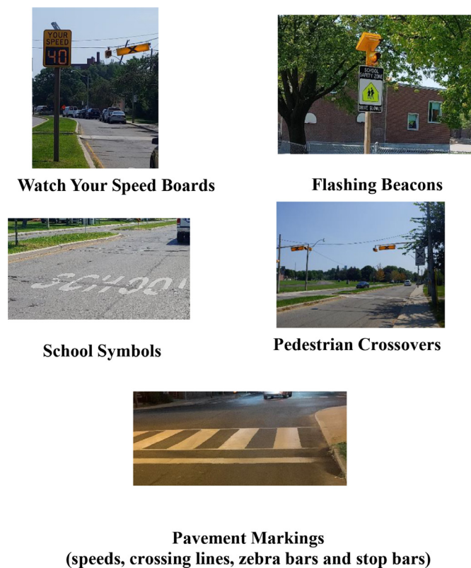
Figure 1 School interventions, City of Toronto (photos by LR, 7 August 2021).

to AST (walking, cycling and other non-motorised transportation) were also measured as AST has health benefits related to physical activity, enhances community and social engagement and benefits the environment. Last, dangerous driving behaviours were measured as they have been associated with higher area-level collision rates surrounding schools and could potentially be associated with less AST. 13 The overall goal of the Vision Zero interventions was to enable safe active transportation by reducing speeds.