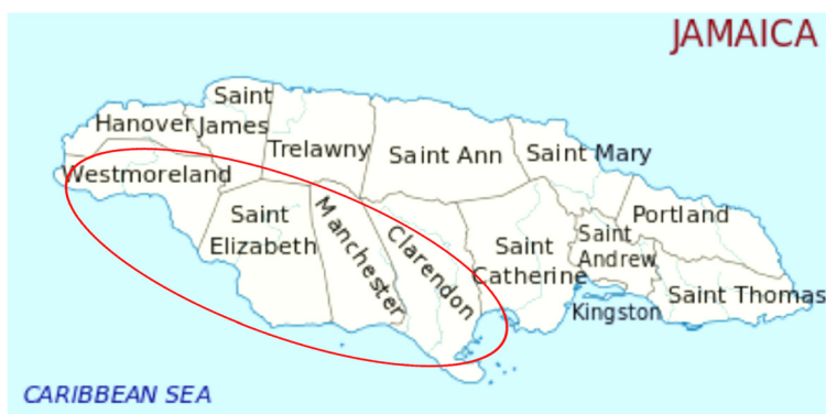
Fig. 1 Map of Jamaica showing the southwestern region with a population of 738,292 served by one fixed urologist

Clarendon and therefore an urban centre, situated in the mid-southern portion of the island (Fig. 1) where he sees patients fortnightly. Patients seen by both urologists in the country offices may be from either urban or rural settings. Patients from the country seen in Kingston by the Kingston-based urologist were excluded from the analysis.